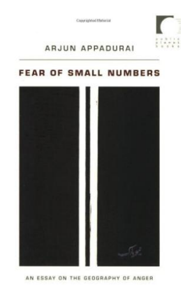
Duke University Press Books. Paperback. Book Condition: New. Paperback. 176 pages. The period since 1989 has been marked by the global endorsement of open markets, the free flow of finance capital and liberal ideas of constitutional rule, and the active expansion of human rights. Why, then, in this era of intense globalization, has there been a proliferation of violence, of ethnic cleansing on the one hand and extreme forms of political violence against civilian populations on the otherFear of Small...